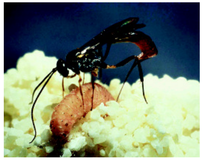
Parasitoids, such as this Venturia canescens, lay their eggs in a host organism. The parasitoid egg will hatch inside the host.