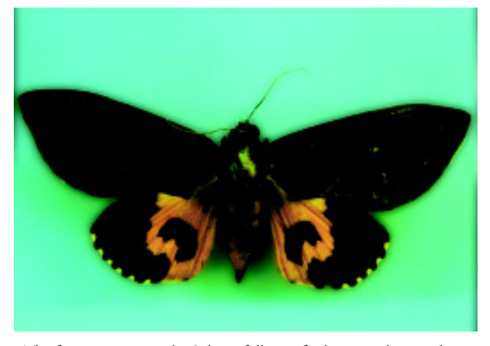
The fruit-piercing moth, Othreis fullonia, feeds primarily at night on a wide variety of ripening fruit by piercing the fruit and sucking out the juices.