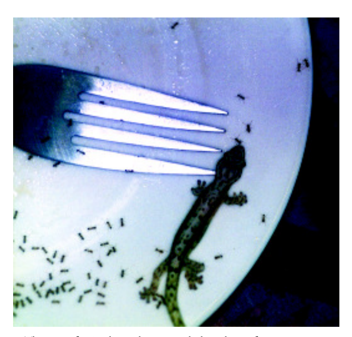
The sizes of animal populations, including those of insect pests, are controlled by other organisms including lizards such as the gecko pictured here.