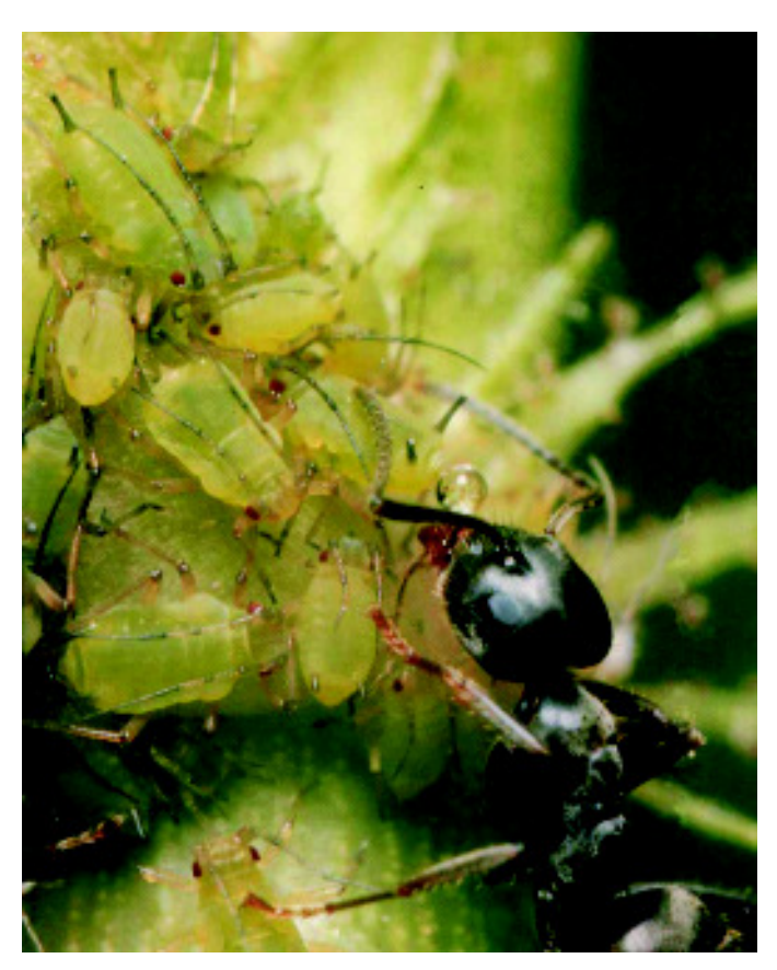
We will often see ants associated with aphid colonies. The ants get honey dew, a sticky sugar solution, from the aphids and repay them by chasing away predators and parasites.