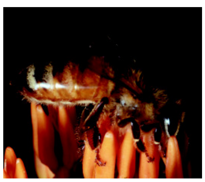
In some species of Hymenoptera (bees, wasps, and ants), the ovipositor has been modified into a stinger used for defense and for paralyzing or killing prey.