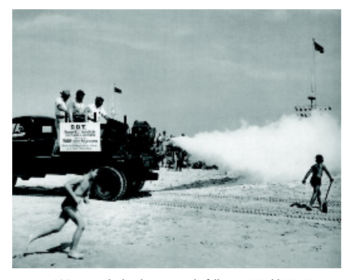
DDT was applied indiscriminately following World War II.

ability to make chemicals which protect them from being eaten by insects and other animals.