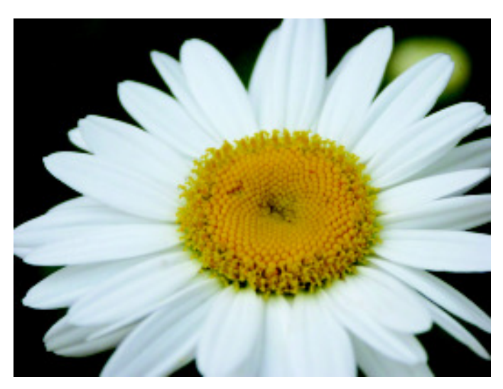
The organic insecticide pyrethrum is made from chrysanthemum flowers