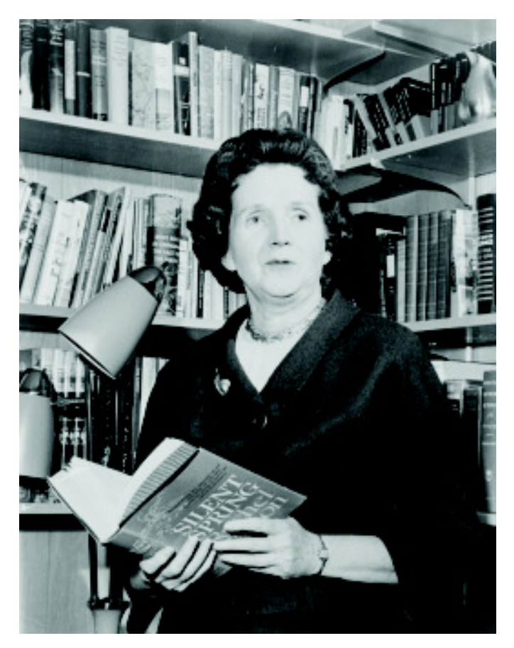
Rachel Carson (pictured) was influential in the banning of DDT after the publication of her book, "Silent Spring".

This type of natural population control is commonly referred to as the balance of nature . Many insect populations are controlled by other insects: predators which hunt them for food, and parasitoids which develop inside them.