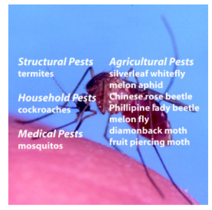
Table 31-1: Important insect pests in Micronesia

Insecticides are poisons that kill insects. There are several broad classes of insecticides. Botanical or organic insecticides are made by extracting chemicals from plants. Many plants have evolved the