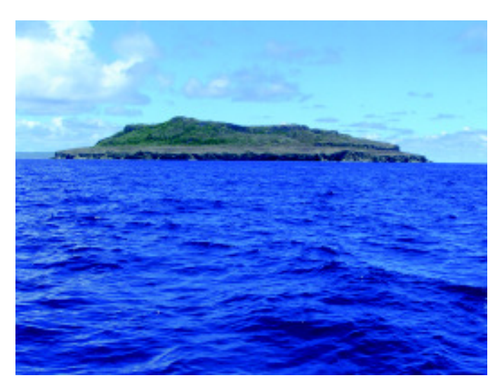
Our small islands do not have as many different habitats as larger islands and continents.