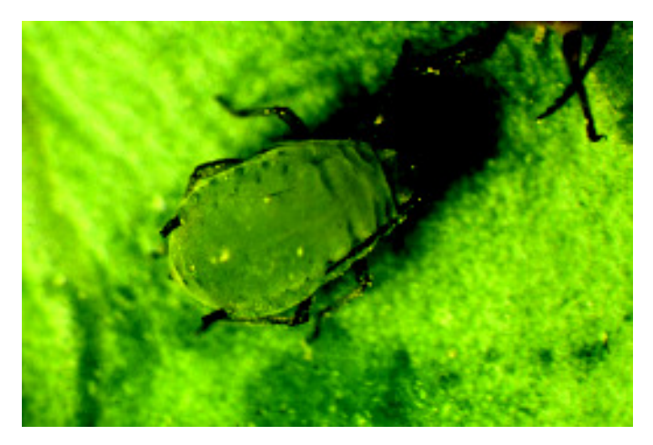
The melon aphid is a major pest of melons and other crops.