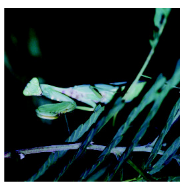
Insect predators, like this praying mantis, help control the populations of pest insects.