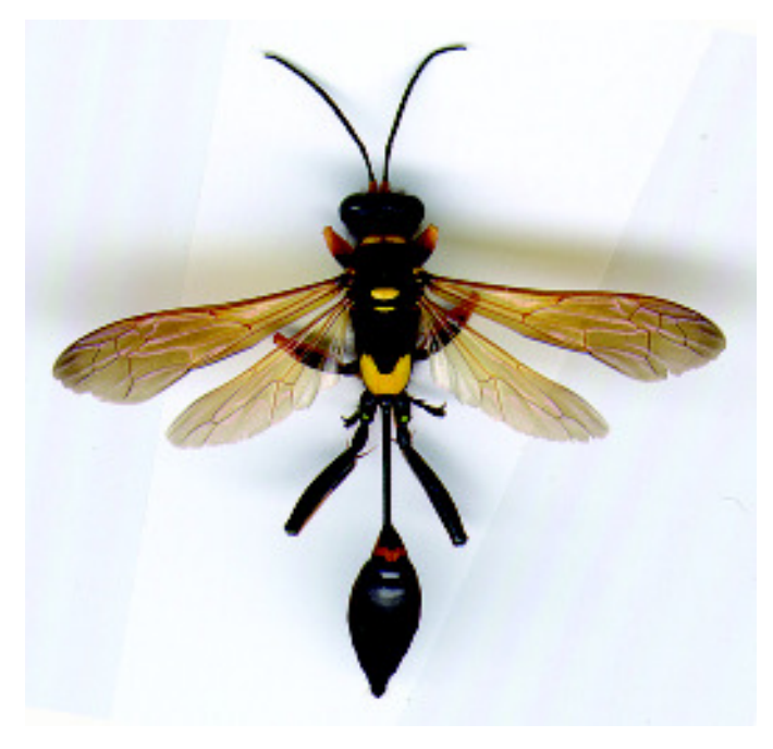
The muddauber stocks her nest with spiders, which she has paralyzed by injecting a small amount of venom using her stinger.