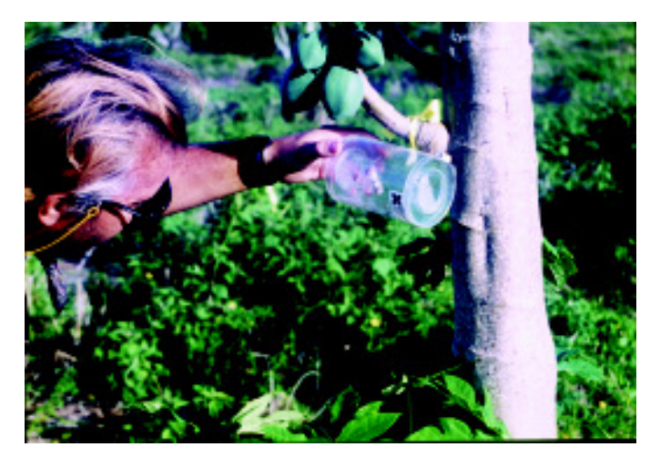
Integrated pest management relies on pest monitoring to determine when pesticide applications are necessary.

Scientists in the CNMI have developed an electronic pest monitor that may some day help farmers keep track of insect population levels in their fields. This monitor uses a photosensor to record sunlight reflected off the wings of insects flying within the field. The recorded signals, which contain insect wingbeat waveforms, are fed into a computer programmed to identify and count major pests as well as their predators and parasitoids.