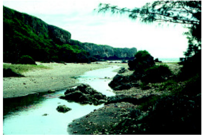
As a river meets the sea, or a large lake, it is carrying clay, mud, sand and other things. Talofoto stream on Saipan is a clear example of this process.

Examples of swamps include the mangrove forests located throughout Micronesia, the South Pacific, and much of the tropical world. The Magpo swamp on Tinian and Saipan’s mangrove swamps within American Memorial Park and near the Tanapag commercial port are two local examples.