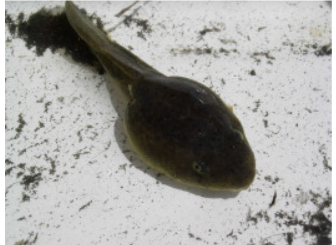
Carnivorous species are maintained by aquatic and flying insects, and by the swimming larvae of toads and other land animals which lay their eggs in water.

Second is the presence of a soil type which shows clear evidence of anaerobic decay . This is decay without the presence of air, a condition caused when water completely covers soil for a long while. This soil type is called hydric soil .