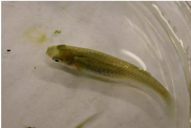
Scientists feel that the introduction of exotic tilapia and mosquitofish (shown) have played a major role in the lake's ecological degradation.

Each has created tremendous problems and damage to native ecosystems in many areas.