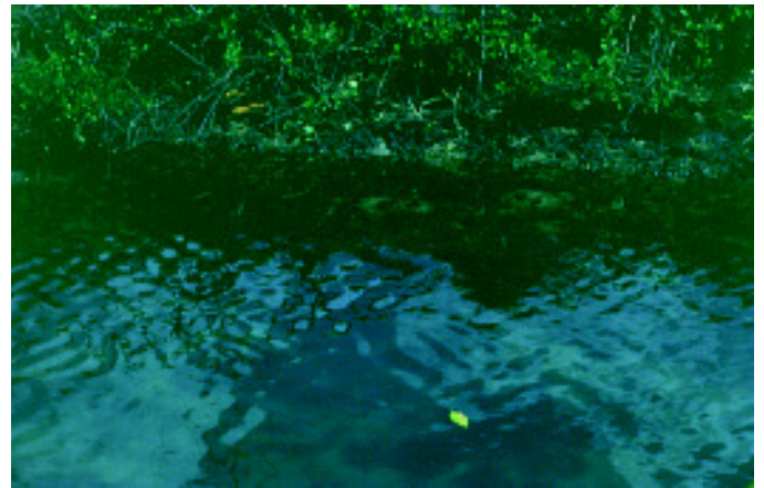
The lake's waters are very abundant with phytoplankton. The color of the lake water is described as dark brownish-green with a faint yellowish-brown tinge.

After Lake Susupe, Lake Hagoi is considered the second most important wetland ecosystem in our Commonwealth. Lake Hagoi, located near Tinian's North Field runways, has developed into a classic circular lake fringed by rings of marshland.