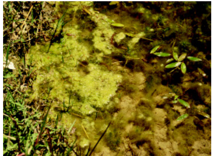
At first, algae live only at the shallow edges, where sunlight can get through. As the lake fills in and gets shallower, algae can live everywhere in the water.