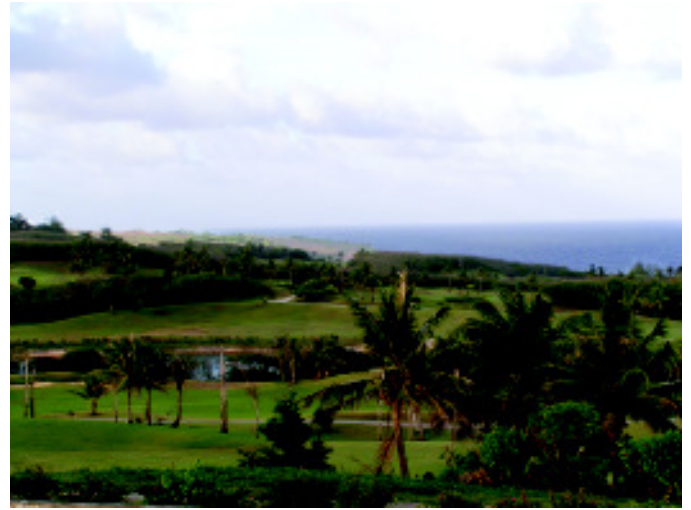
Golf courses often plan for and construct water bodies as part of their landscape beautification efforts.

An easy way to know an oligotrophic lake is to visit it in the warmest part of the year. Take a water sample from the bottom; test it for dissolved oxygen.