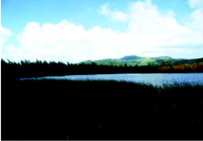
As some of our last wilderness areas, wetlands attract those who simply enjoy the beauty and sounds of nature in the wild.

Although included within the lentic general category, wetlands are geographic areas with characteristics of both dry land and water. Wetlands typically occur in low-lying areas at the edges of lakes, ponds, streams, and rivers, or in ocean-fronting coastal areas protected from waves. They are found in a variety of climates on every continent except Antarctica.