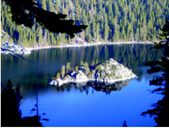
A lake that is clear and clean, with few organisms—is oligotrophic.

Warm weather is the time to find organisms, and most of them need oxygen. If you find oxygen at the bottom of the lake, there can't be many organisms because they would have 'breathed' it all up.