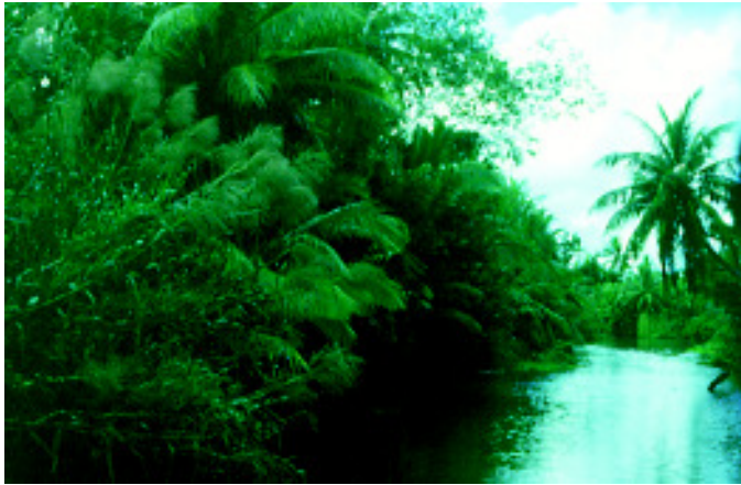
Ravine forests grow throughout Micronesia