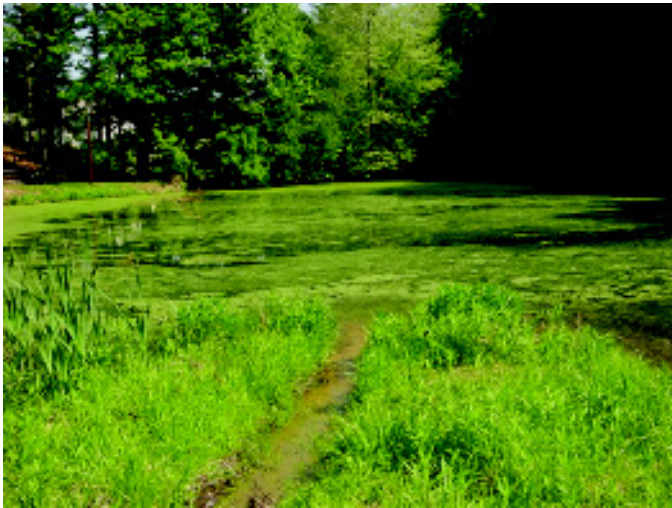
Lakes that are shallower and not so clear—are eutrophic.

Dystrophic lakes don't fit the usual pattern. As mentioned earlier, Lake Susupe on Saipan is dystrophic.