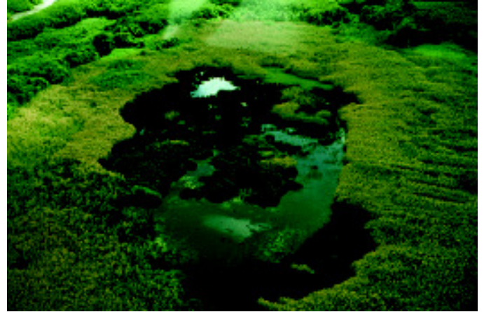
All lakes become ponds; all ponds evolve into marshes or swamps; all marshes into dry land. Hagoi Lake on Tinian is a clear example of this.

Now the lake is shallow, the water not so clear because it has lots of algae and animals and more mud. It's not quite so cold at the bottom, this is because more sunlight reaches there.