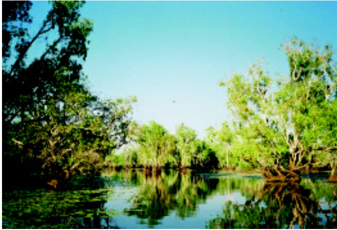
The increase in biomass in an evolving lentic system provides plants more soil to put their roots into.

We can see what's coming—the lake will fill in more and more. Every year more things can live in it. More organisms can also die in it and add more decaying matter. The shoreline grows more and more into the lake. The lake gets smaller. Pretty soon our lake becomes a pond.