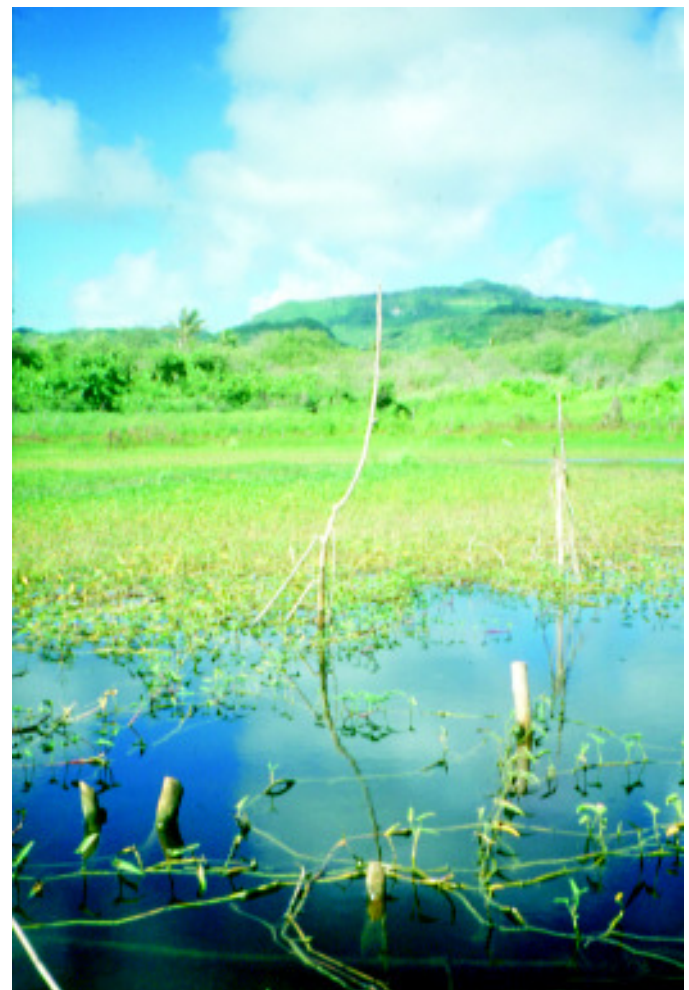
Wetlands are now recognized as being some of the most unique and important natural areas on earth.

Wetlands also provide food and shelter and essential breeding and wintering grounds for many species of migratory wildlife. These natural areas along rivers, streams, and ponds are often linear corridors serving to create bridges within and between our remaining areas of wildlife habitat.