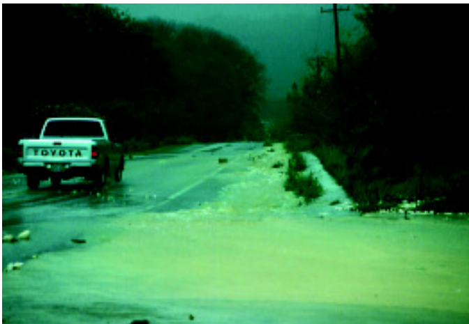
By holding excess water and slowly releasing it to downstream areas, wetlands help control flood waters that damage property.