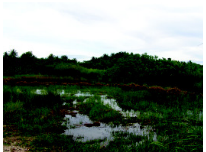
The most prominent and accessible mitigation pond site is this one next to the Price-Costco store.