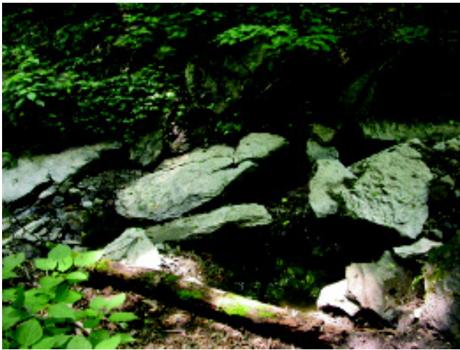
Geographical areas with flowing water are given the names “streams” and “rivers”.