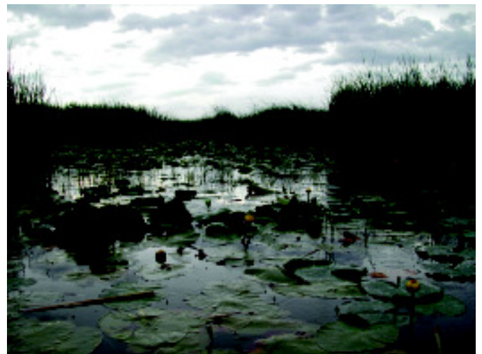
Marshes are periodically or continually flooded wetlands with emergent herbaceous plants.