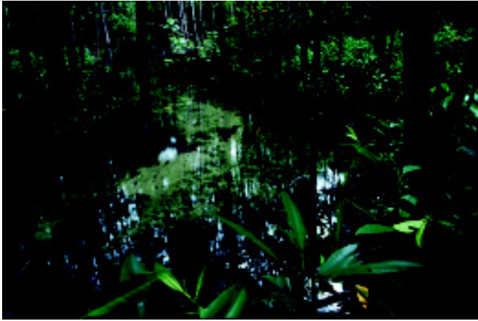
Mangrove swamps are a type of marine wetland.

Stream branches, brooks, and creeks—better known as “cricks”—are often tributaries of rivers. The name tributary means that streams “pay tribute”. They donate water to rivers by dumping their contents into them.