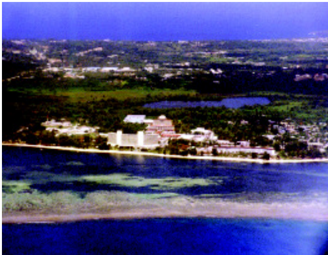
Lake Susupe lies in a broad, shallow depression on the western edge of an extensive low wetland.

This new land closed off the lagoonlet from the sea. We know that both coastal limesands and marsh deposits are of recent geologic origin.