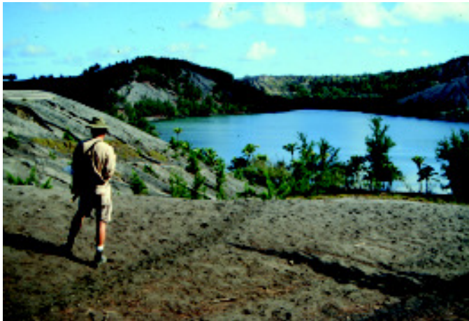
Pagan has two lacustrine wetlands.