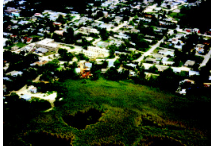
Uses of Lake Susupe have severely degraded its ecological integrity.

Both species have been distributed virtually world-wide for purposes of aquatic plant and mosquito control and as a fishing resource.