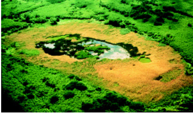
After Lake Susupe, Lake Hagoi is considered the second most important wetland ecosystem in our Commonwealth.

Adoption by waterfowl occurs best when about a third or more of the ponds are allowed to have a gently sloping fringe of emergent vegetation and if inside-the-pond "islands" are constructed and allowed to become vegetated.