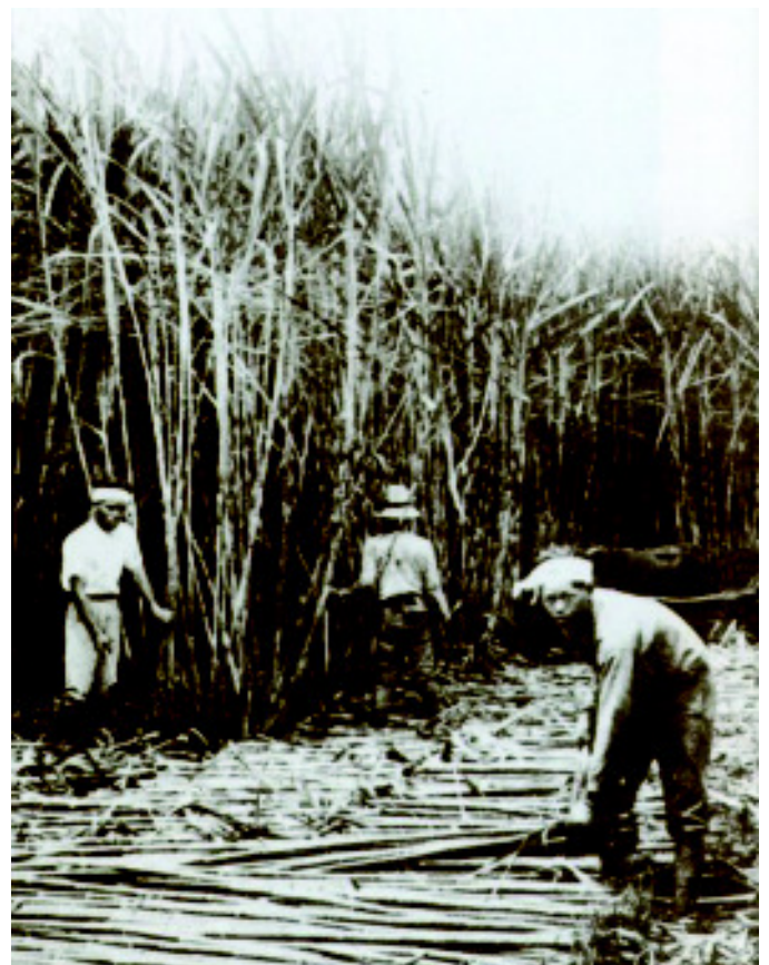
The sugar industry on Saipan used water from Lake Susupe in the washing process.