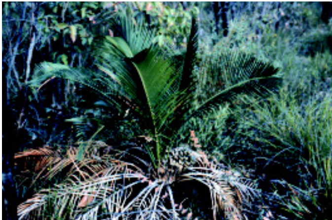
Cycads (FADANG) are always found in our stream-adjacent ravine forests.