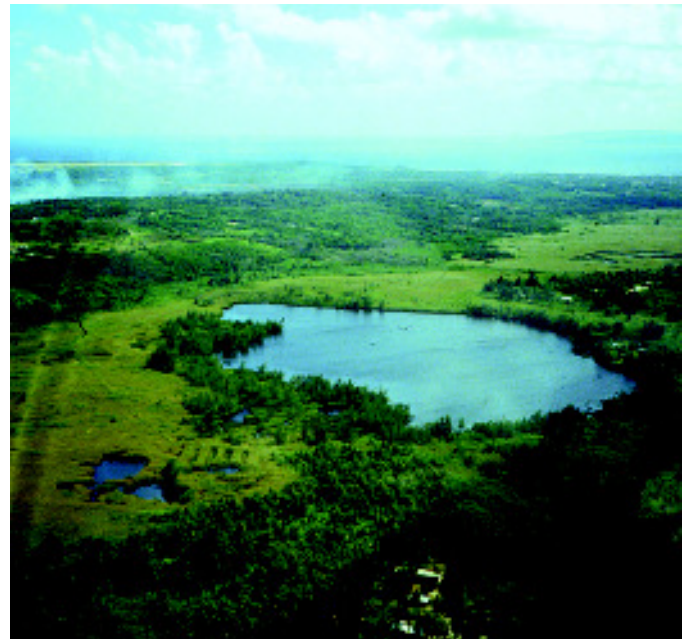
Lentic ecosystems include aquatic systems without currents. These include ponds, lakes, bogs, swamps and marshes.